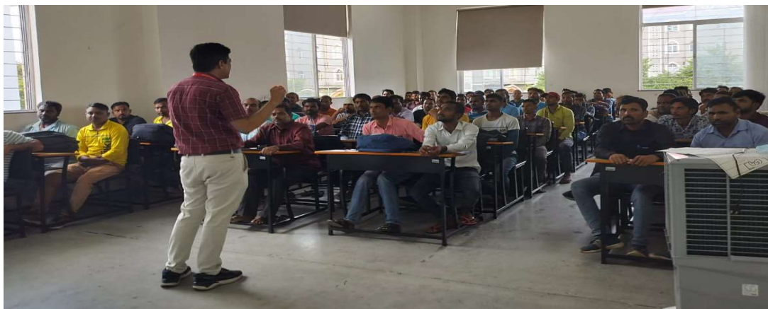
Candidates soft skill training and English Language session during RPL