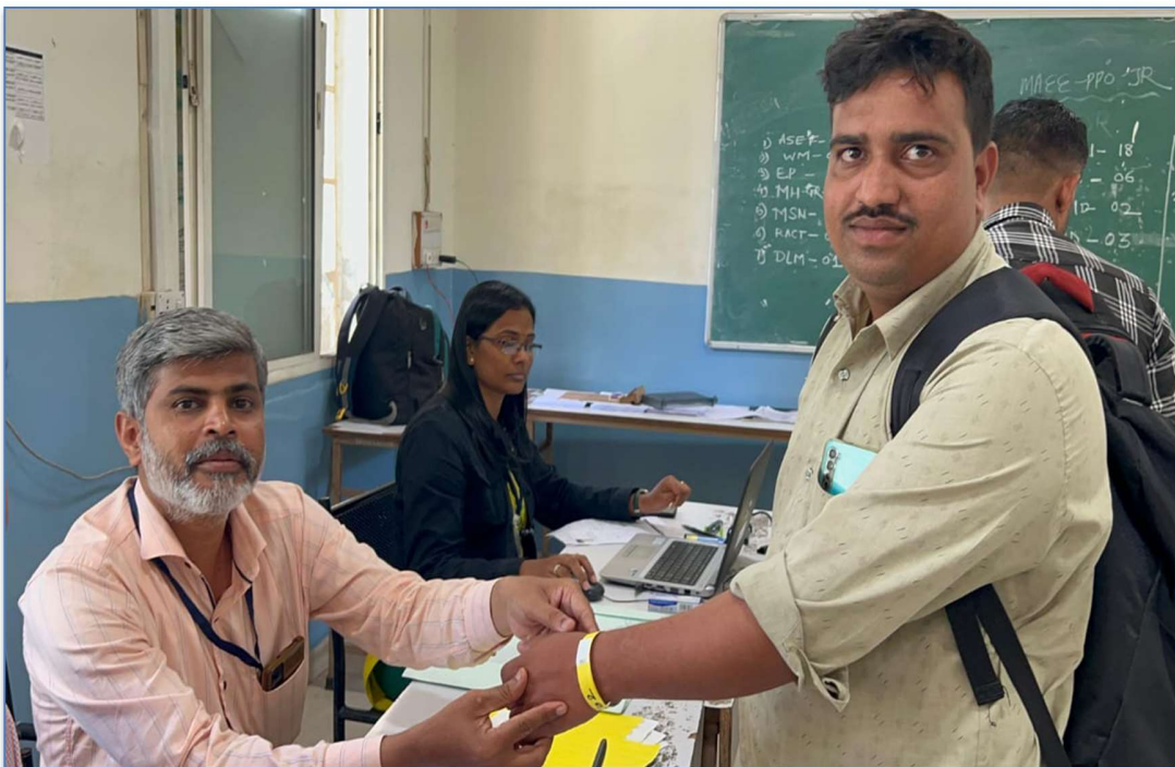
Candidate PIBA registration process at ITI Aundh