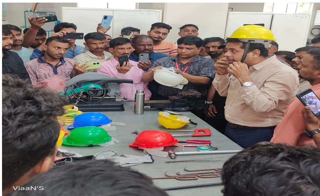
Candidates attending shutter safety training and practical orientation during RPL