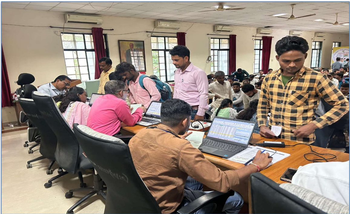
Candidate NSDC registration process at ITI Aundh