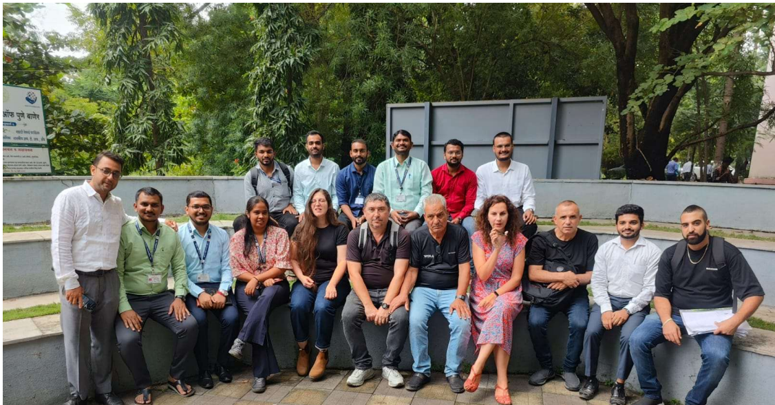
MITRA team along with Israeli Assessors and PIBA representatives

Israeli Assessors and PIBA (Population and Immigration Authority) representatives were instrumental in ensuring that the skill assessment of candidates was conducted as per international standards. Their presence added credibility to the drive, guaranteeing that only the most skilled and qualified candidates were selected for placement in Israel. They also provided important insights during the registration and examination phases, ensuring a smooth and efficient process.