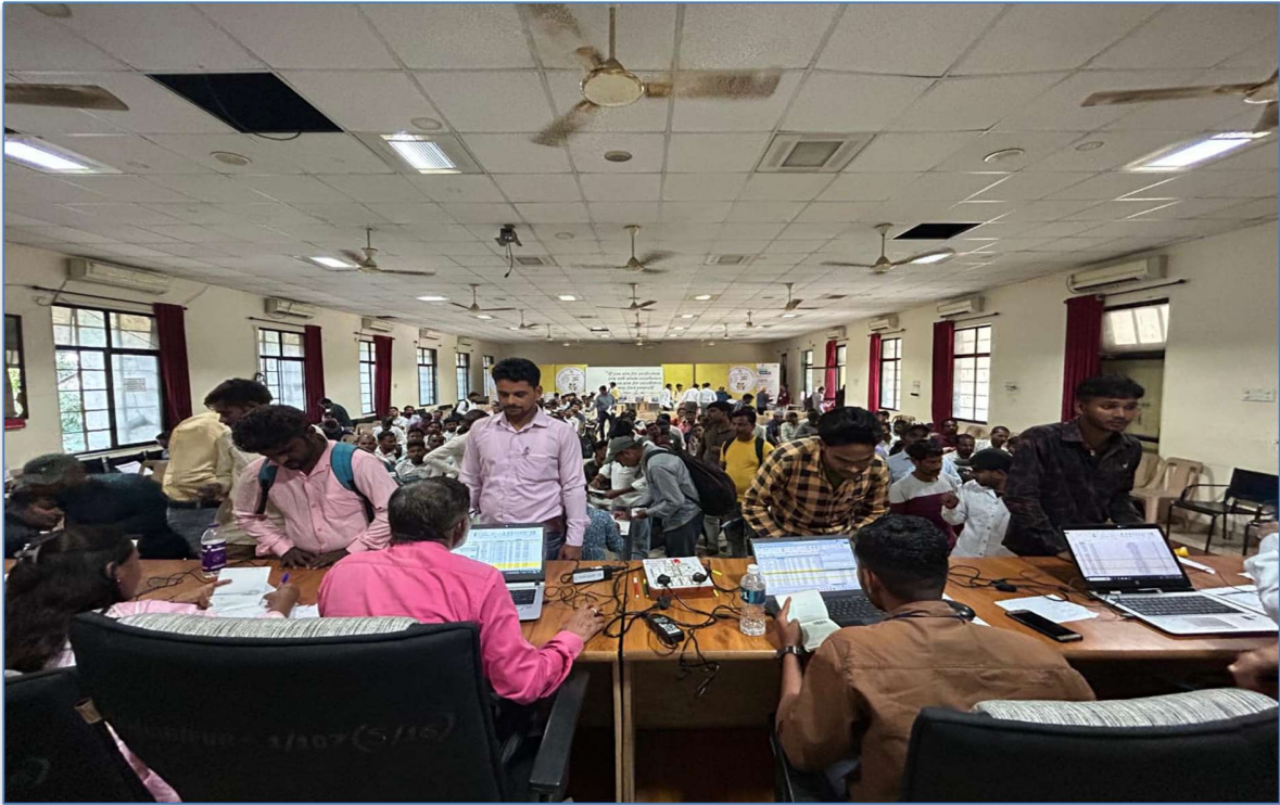
Candidate NSDC registration process at ITI Aundh