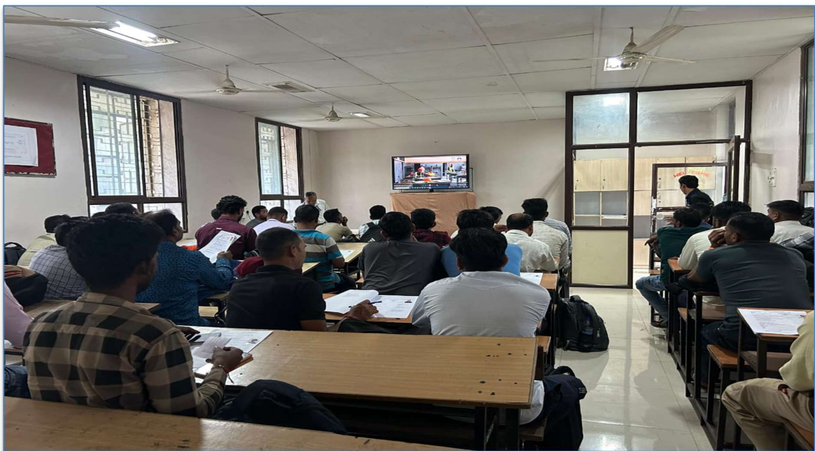
Candidates attending orientation on overall process and job conditions in Israel