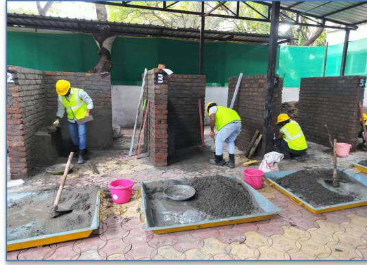
Israel team assessor evaluating technical skills of candidates in plastering section