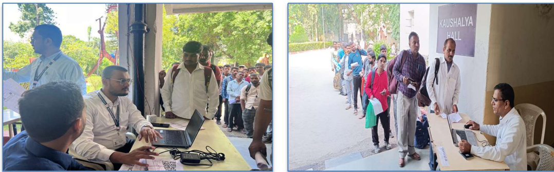
Candidate's name check process at ITI Aundh