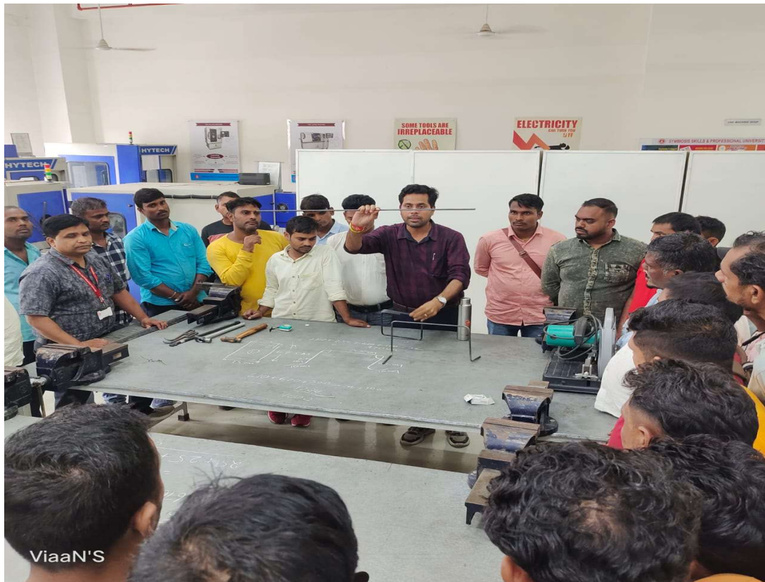
Bar Bending training given by tutor to candidates during RPL