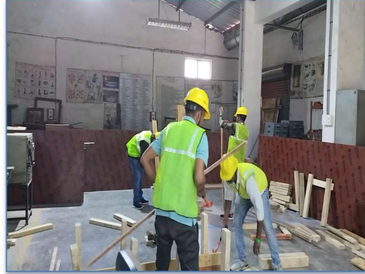
Israel team assessor evaluating technical skills of candidates in Formwork sector