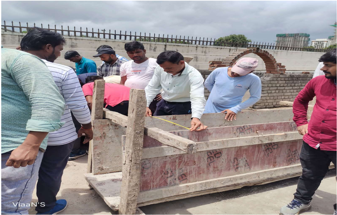
Candidates attending shutter Carpentry / centring training during RPL